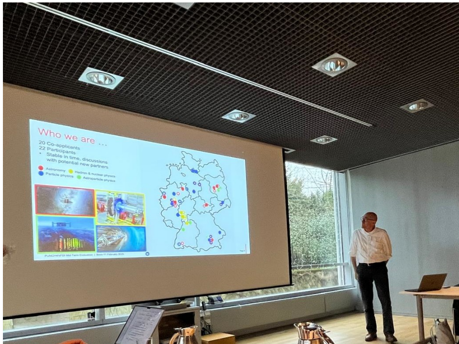
Figure 1: Presentation of PUNCH4NFDI at the DFG Zwischenberichtssymposium, February 2025 in Bonn.

A Letter of Intent was signed between the ESCAPE project and PUNCH4NFDI in September 2024. Thus, the two partners plan to strengthen their collaboration and share expertise in order to enhance scientific data management, as well as FAIR and Open Science.